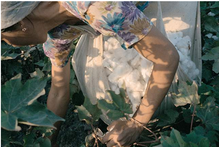
© Claudine Doury – Loulan Beauty – Récolte du coton à Kokand