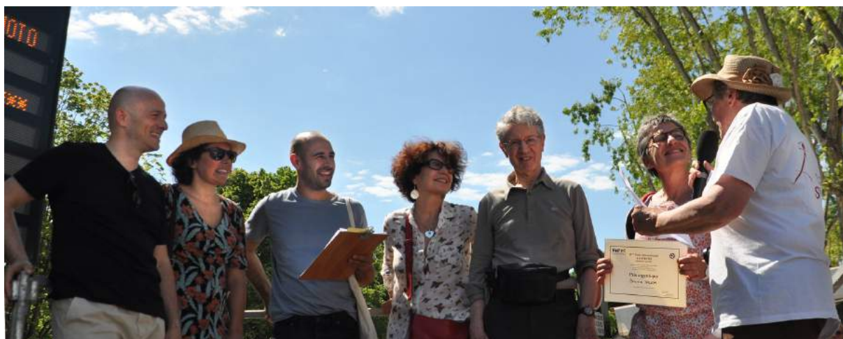
Award ceremony 2019