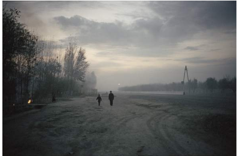
© Claudine Doury – Loulan Beauty – La route de Samarcande

Claudine Doury explains that Loulan Beauty describes the slow disappearance of a world sinking into the sands of time. It is a voyage which takes place after the collapse of the Soviet empire, across central Asia and the Xinjiang region of China. Loulan Beauty bears witness to those men who are at the centre of the world, heirs to kingdoms that have been swallowed up and disappeared, to fishermen without a sea, to children who dance to bring back their parents who have gone far away to find work, to Lola who dreams of America, to men who can hear the sands singing, to little girls with a thousand pigtails, the same as those that were found on Loulan, their ancestor from 4,000 years ago.“