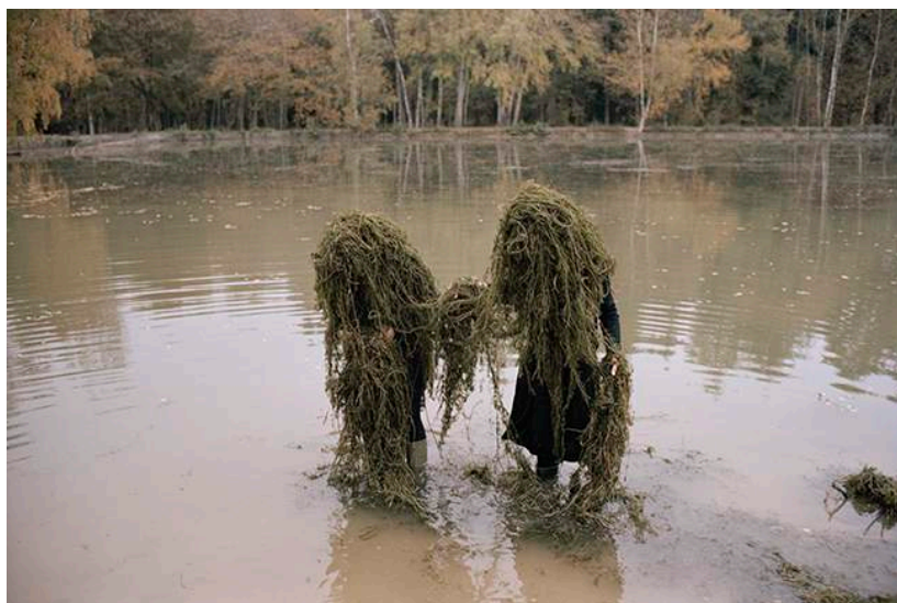
Sasha - Les algues

In Sasha , she presents the portrait of a teen-aged girl, somewhere between dream and reality. Her portraits depict with great delicacy the complex transition from girlhood to adulthood. Nature is ever present (forests, water, fields, snow). It is a dreamlike world, simultaneously strange and mysterious, attractive and intriguing.